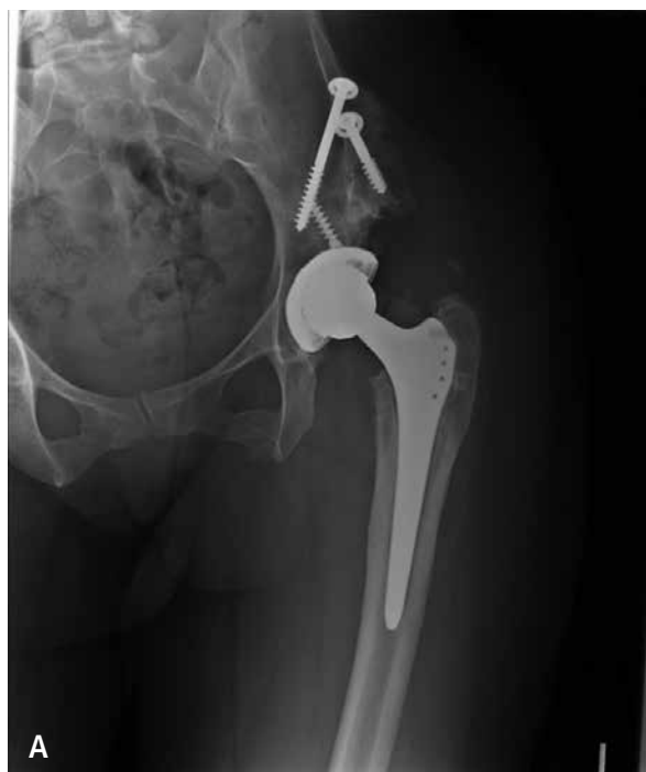
Figure 2a. Anteroposterior radiograph of a 35 year old female five years status post MOM total hip replacement for acetabular dysplasia and severe secondary osteoarthritis. She was initially pain free but now has diffuse left hip pain.