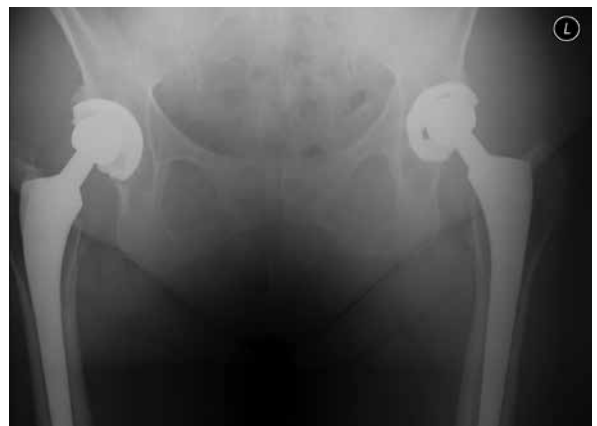
FIGURE 1. BILATERAL TOTAL HIP REPLACEMENT

Figure 1. Twenty year followup pelvis radiograph in a 65 year old female with bilateral total hip replacements for moderate acetabular dysplasia and osteoarthritis. Her functional status bilaterally is excellent though the radiographs demonstrate moderate linear wear of her conventional polyethylene liners.