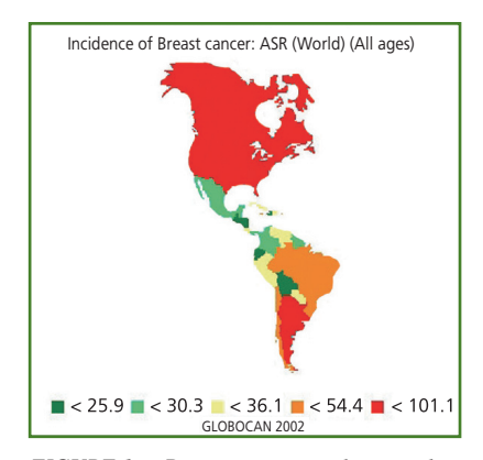
FIGURE 1a: Breast cancer incidence in the Americas, rate per 100,000 (age-standardized rate, world standard population).

(26 / 100,000), as estimated by the International Agency for Research on Cancer (IARC) (2). South America's breast cancer incidence is intermediate between the two (46 / 100,000) (Figure 1a). Breast cancer incidence varies widely among South American countries. The highest risk South American countries include Argentina (74 / 100,000) and Uruguay (83 /