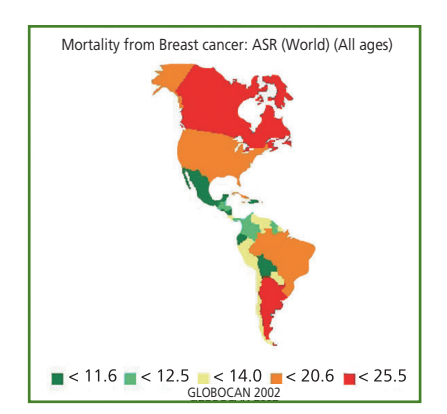
FIGURE 1b: Breast cancer mortality in the Americas, rate per 100,000 (age-standardized rate, world standard population).

(26 / 100,000), as estimated by the International Agency for Research on Cancer (IARC) (2). South America's breast cancer incidence is intermediate between the two (46 / 100,000) (Figure 1a). Breast cancer incidence varies widely among South American countries. The highest risk South American countries include Argentina (74 / 100,000) and Uruguay (83 /